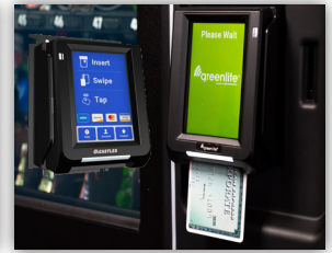
Greenlite Cashless System option accepts credit/debit cards and mobile wallets.